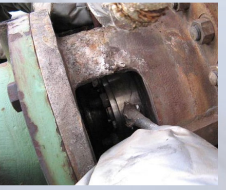
The sulfur transfer pump after retrofitting to EagleBurgmann SulfurAce: no leakage, no contamination