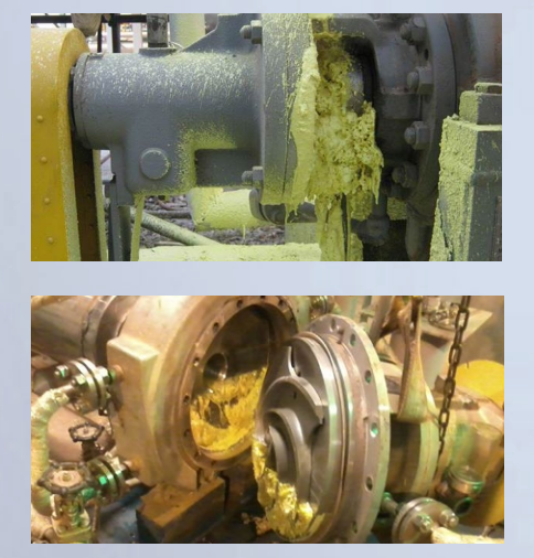
Examples of crystalline sulfur leakage outside and inside of pumps

Seal face and seat: Silicon carbide (SiC) Secondary seals: FKM (V), Perfluorocarbon rubber (FFKM) Spring and metal parts: SS316 (1.4401)